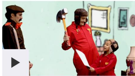
Titch and Ted Learn About Halves (pt 2/6)

Titch teaches her uncle Ted that two halves can make a whole.