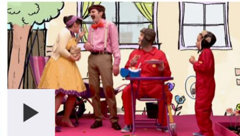
Titch and Ted Learn About Quarters (pt 3/6)

Titch must use her knowledge of halves to make the perfect shelves for Mr Pie.