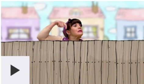
Titch and Ted Learn About Sixths (pt 4/6)

Titch teaches Ted about halves and quarters in Mr Pie's garden.